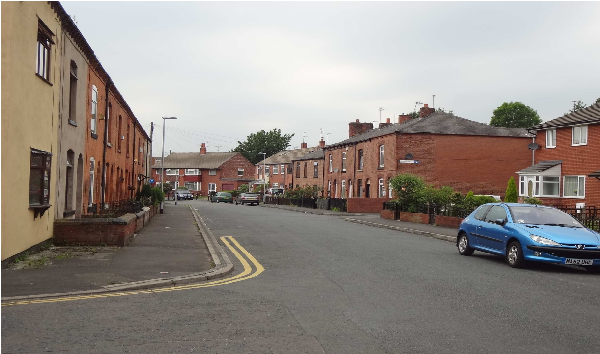
AFTERNOON (14.30) BEECH STREET